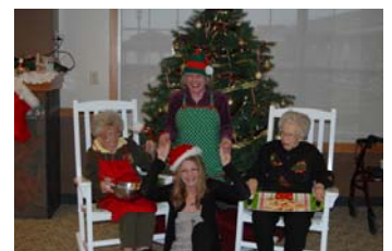
Laughter is the best medicine!