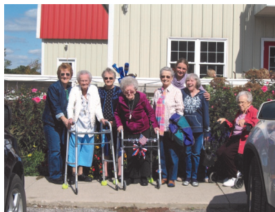
At Summerset Winery

This beautiful fall weather has given us all some wonderful opportunities to get out and about! We had such a fun afternoon at the Summerset Winery; and with such energetic companions! For our activities this month, I would like to continue to get out and about as much as we possibly can before the weather turns on us. I would also invite anyone who has a suggestion for an activity or and outing to please feel free to let me know. We Love to customize our schedules here at Windsor Manor to fit YOU! For those of you who are perhaps hesitant to accompany us on outings because of concerns with mobility, time schedules, or even just jitters when it comes to participating in things you