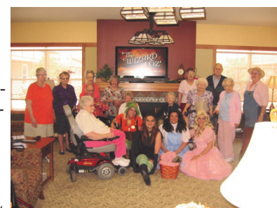
Wizard of Oz Anniversary Fun