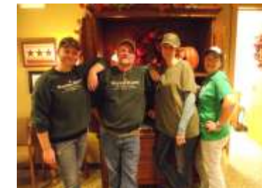
Dressing like Paul