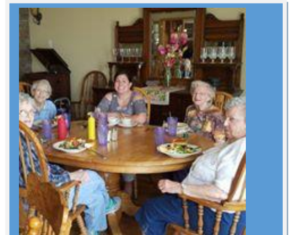
Ladies Lunch at Country House