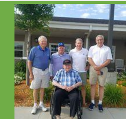
Windsor Manor Golf Team with resident Frog

FOR THESE PHOTOS, AND MANY MORE VISIT WINDSOR MANOR AT NEVADA ON FACEBOOK!