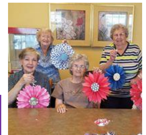
Craft time with the ladies

FOR THESE PHOTOS, AND MANY MORE VISIT WINDSOR MANOR AT NEVADA ON FACEBOOK!