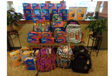
Items purchased from sale proceeds in 2017