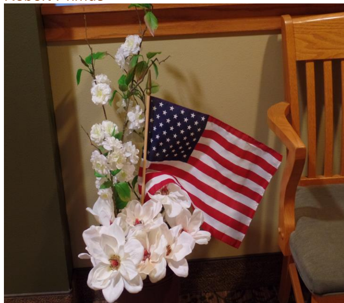
God Bless America, Flag Day, 2018