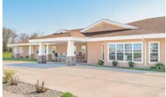
Windsor Manor – Indianola, IA

229 Pearl St. Grinnell, IA 50112 641-236-8700