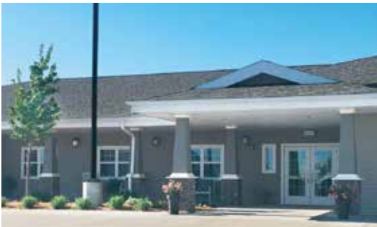
Windsor Manor – Nevada, IA

608 S 15th St. Indianola, IA 50125 515-961-8900