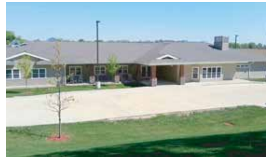
Windsor Manor – Vinton, IA

1642 South G. Ave. Nevada, IA 50201 515-382-2980