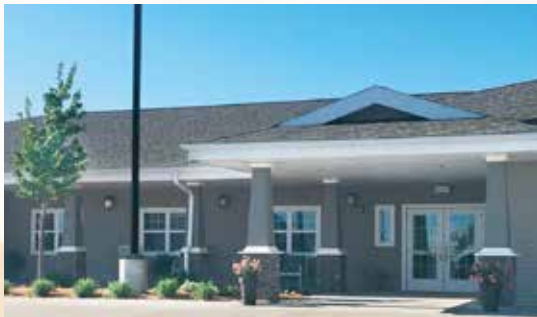
Windsor Manor – Webster City, IA

1807 W. 5th St. Vinton, IA 52349 319-472-2060