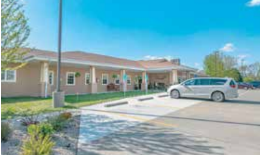
Windsor Manor – Grinnell, IA

229 Pearl St. Grinnell, IA 50112 641-236-8700