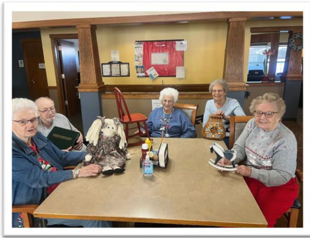
Show and Tell