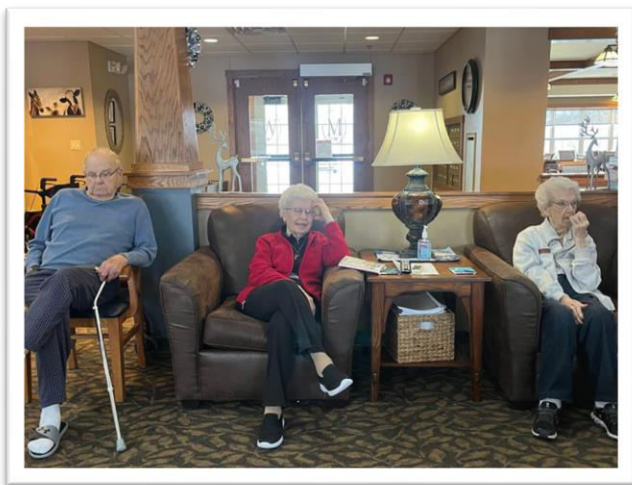
Jeopardy for National Florida Day