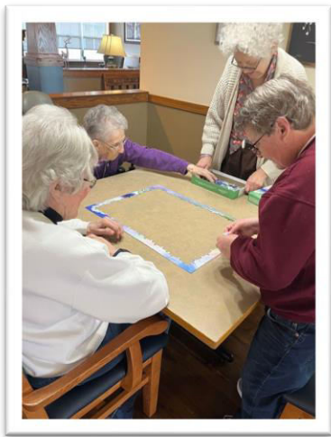
National Puzzle Day