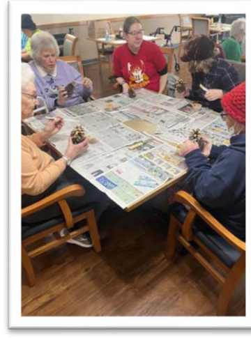
Friends Forever Bird Feeders