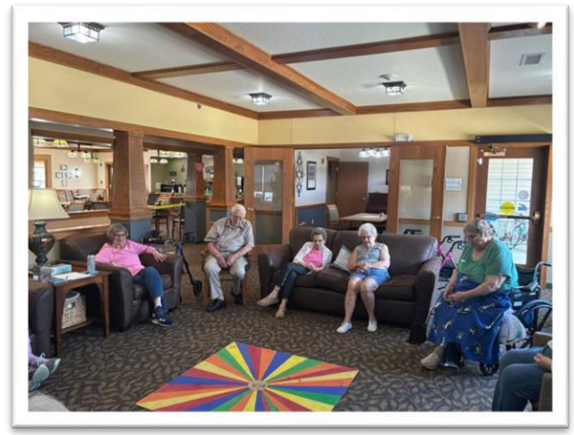
Coin Flick Day